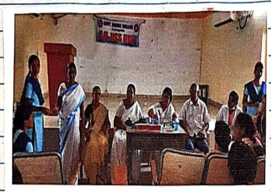
WORLD HEALTH DAY

world Health Day: NSS and WEC Tointly Organised works Health Day. Hemo globin Tests were conducted for so girl students.